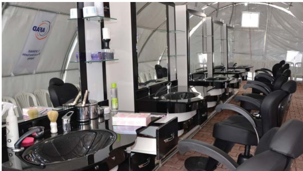
Image-2: Hairdressing Class at a Temporary Refugee Center (image compiled from conference presentations)

Studies conducted on the subject show that the countries which cannot successfully accomplish integration processes confront serious problems. It was emphasized that many of these problems stem from the marginalization of newcomers, especially youth.