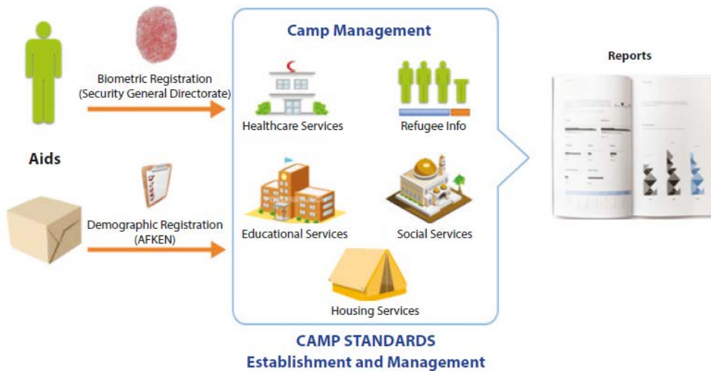
Figure- 3: The management system of temporary refugee centers established for Syrians under temporary protection in Turkey (image compiled from conference presentations)