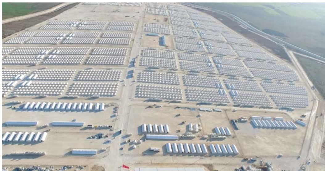
Image- 4: DEMP Suruç Tent City Accommodation Center (image compiled from conference presentations)

These boats, made of rubber most of the time are often unreliable and lack adequate equipment. Although they have a capacity of 10-20 people, they often smuggle more immigrants than they can carry. These boats are deliberately pierced on the sea by Greece and immigrants are left to die. Afterwards Greece calls the Turkish Coast Guard to report the incidents. Immigrants are either left to die in this way or they freeze to death in the cold weather. There have also been major failures regarding the punishment of smugglers who accept more people than these boats can accommodate.