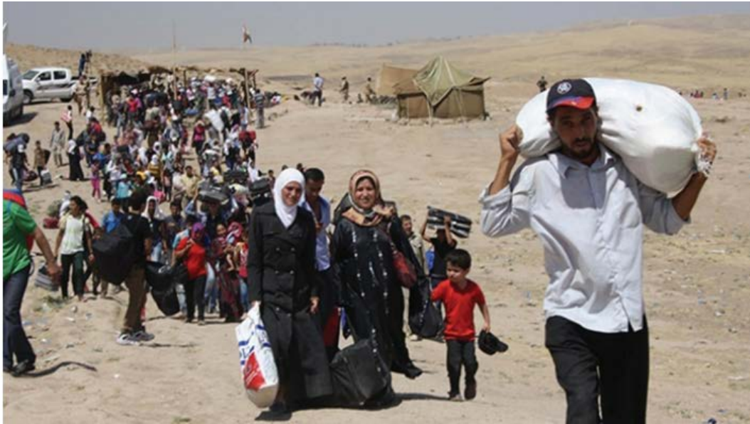
Image- 1: Mass Migration from Syria to Turkey (image compiled from conference presentations)

existing economy both as consumers and agents taking part in production processes. This implicates an environment in which opportunities and risks coexist.