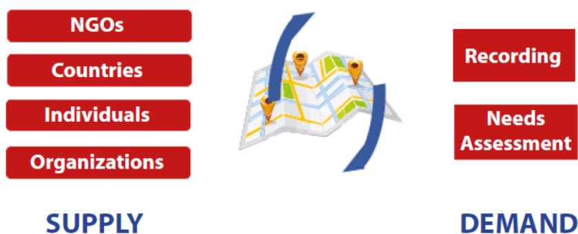
Figure- 4: The aid distribution system outside of refugee centers (image compiled from conference presentations)

The first admission to the Temporary Refugee Centers was carried out for 252 people who entered Turkey on April 29, 2011 from Yayladağı, Hatay. This rate increased rapidly until the beginning of 2014. This increase was less rapid from 2014 to 2015. In January 2014, there were 224.000 people living in Temporary Refugee Centers. The number of people living in temporary refugee centers decreases between July and September when some people leave to work as seasonal workers.