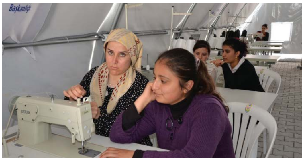
Image- 5: Textile Course at a Temporary Refugee Center (image compiled from conference presentations)

old paradigm. Furthermore, there are currently 12.630 volunteer Syrian teachers in Turkey. These teachers trained in the Turkish pedagogical formation. Education geared towards adults is also provided within the scope of non-formal education. A total of 237.509 Syrians have been provided with an education in the scope of vocational training. Public education centers have organized Turkish classes for 137.729 Syrians.