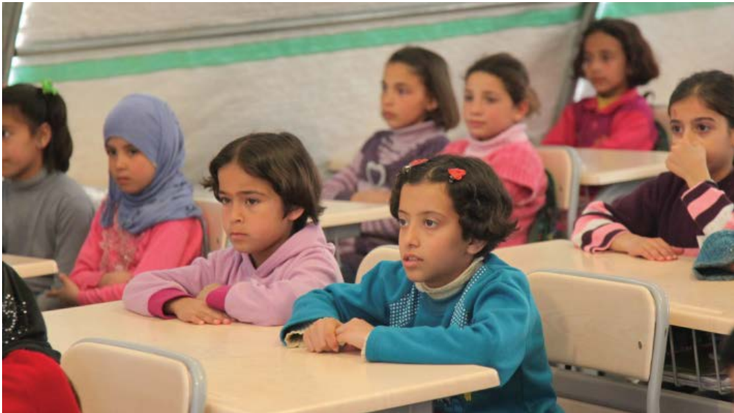
Image- 3: A group of Syrian children under temporary protection attending a class in DEMP Suruç Tent City Accommodation Center (image compiled from conference presentations)

Such an education system is required to encompass both Turkish and Syrian children. In line with this objective, structural factors in the education system must also be reformed and specific policies addressing immigrants must be implemented.