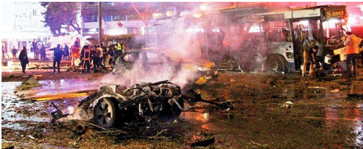
An Image from Ankara Güvenpark Attack Organized by PKK

The recent mass civilian killings of the PKK have been perpetrated by its Syrian offshoots PYD/YPG. ‘Syrian Network for Human Rights’, an independent international human rights organization, have issued several reports on torture and killings in Syria perpetrated by PKK/PYD/YPG. 11 The photographs and videos presented in the reports portray the extent of violence the PKK engages in. These photos and videos were also published by several official bodies such as Anadolu Agency.