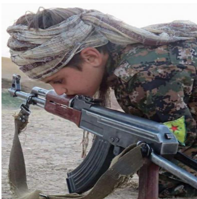
A child swearing on a weapon by the force of PKK's Syrian offshoots PYD/YPG.

In a bulletin released on June 1, 2010, UNICEF stated that they were deeply concerned about the children in the PKK rank.