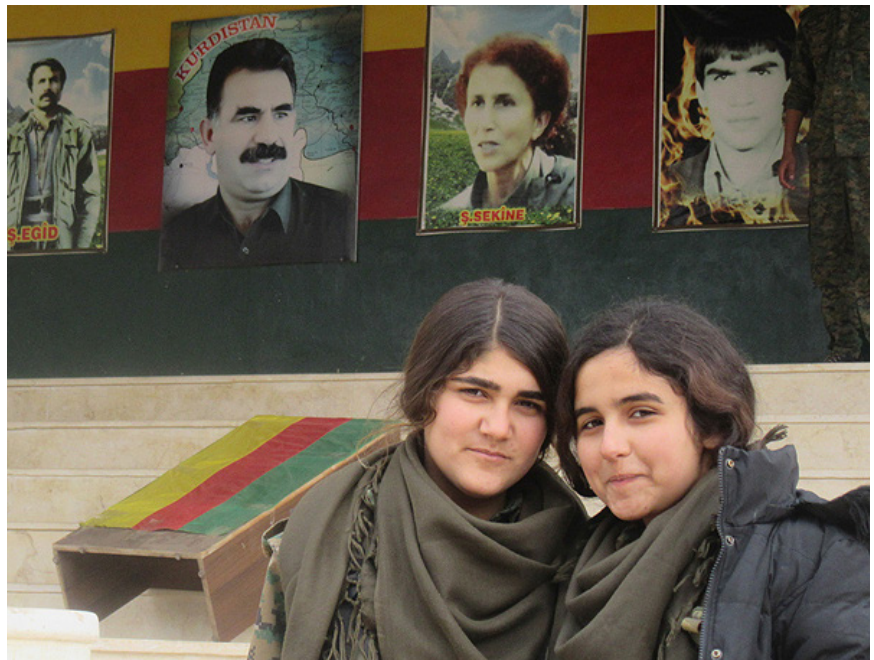
Children's Ideological Training Given by the PKK/PYD/YPG