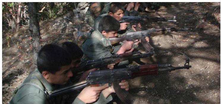
Children's Military Training Given by the PKK/PYD/YPG