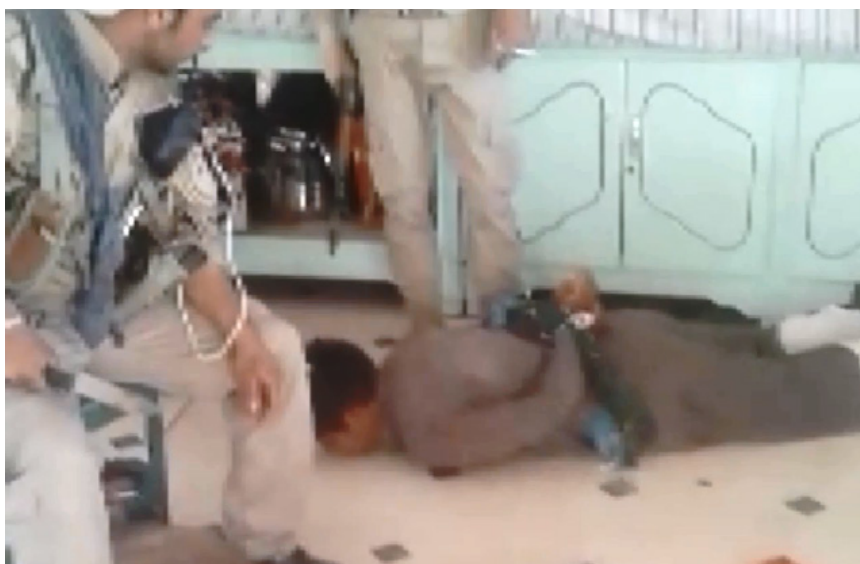
PKK's Tortures and Executions in Syria

The recent mass civilian killings of the PKK have been perpetrated by its Syrian offshoots PYD/YPG.