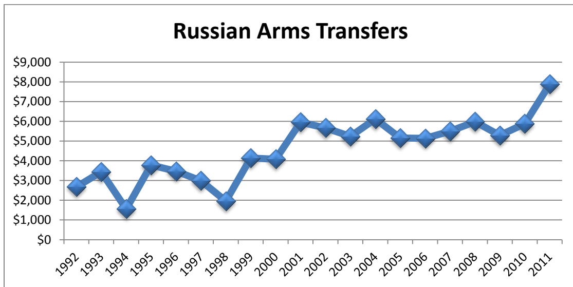
Figure 2: Annual worldwide Russian arms transfers since 1992

The Russian arms industry went through the same period of contraction in the 1990s as most other Russian industries. 123 Russia took up a smaller share of worldwide arms transfers, and its production for domestic consumption dropped as Russia shrunk its military spending. Beginning in 1999 the volume of arms transfers rebounded, and since has remained high. From 1999 to 2011, Russia ranks second among worldwide arms exporters (valued by SIPRI's TIV at $72 billion), trailing only the United States ($95.8 billion), and far outpacing third place Germany ($24.8 billion). The following is a chart of Russian arms transfers (using SIPRI's TIV) from 1992 to 2011: