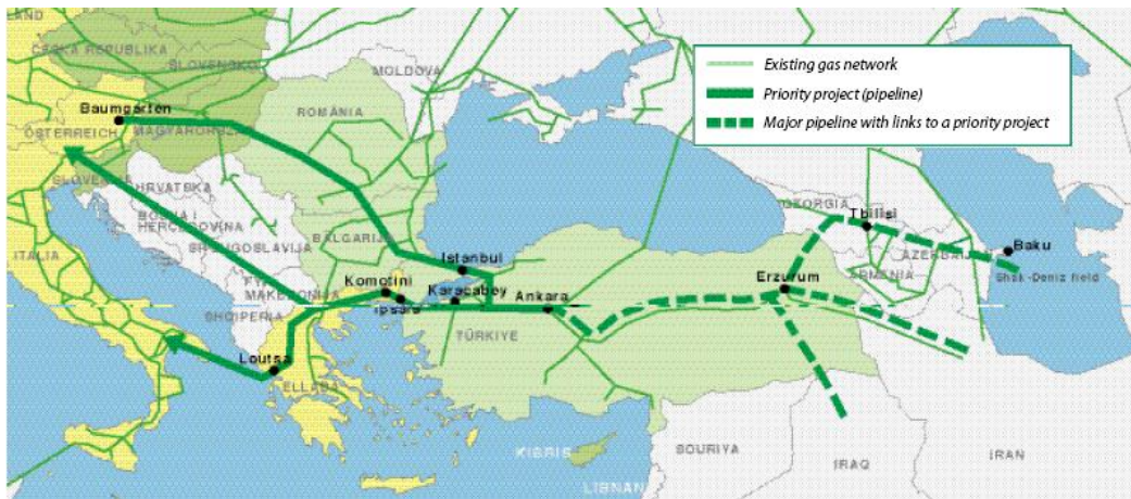
Figure 5: Map of the proposed Nabucco Pipeline 146

Central European countries. Thus, Russia and others have begun the construction of the Nord Stream Pipeline and the South Stream Pipeline, two routes that accomplish this goal. The third option is to build pipelines that bring natural gas from non-Russian fields to Europe without transiting Russian territory. This option is the preference of Eastern Europe and the United States, among others, and the result is the proposed Nabucco Pipeline, shown in better detail on the map below.