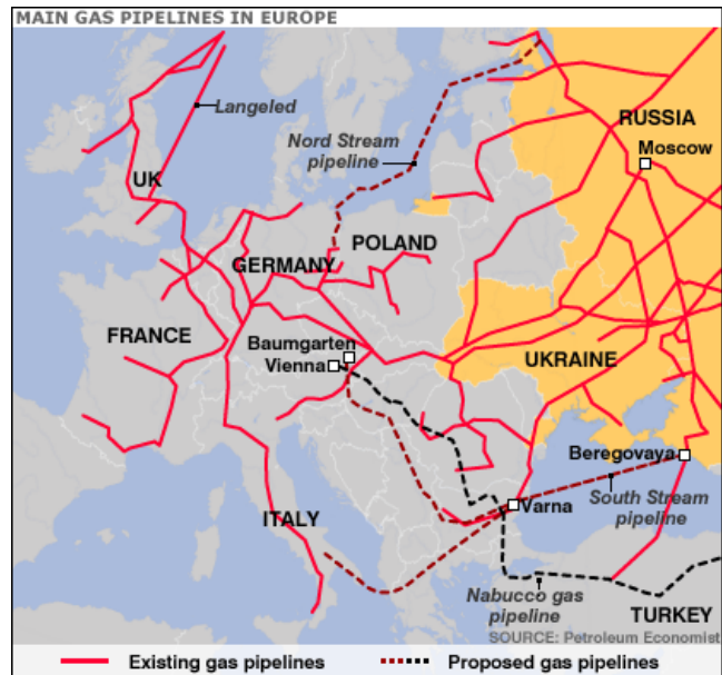
Figure 4: Map of Europe’s natural gas pipeline network 145

In January 2006, Russia cut off natural gas to Ukraine in order to gain political leverage. As can be seen from the map, every natural gas pipeline that runs into Europe runs through Ukraine first. So in January 2006 much of Europe came to realize that their supply of gas could be disrupted by disputes between Russia and its immediate neighbors.