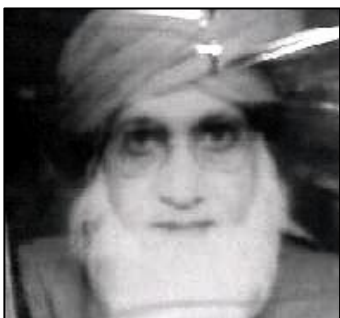
Maulana Muhammad Ilyas al-Kandhlawi