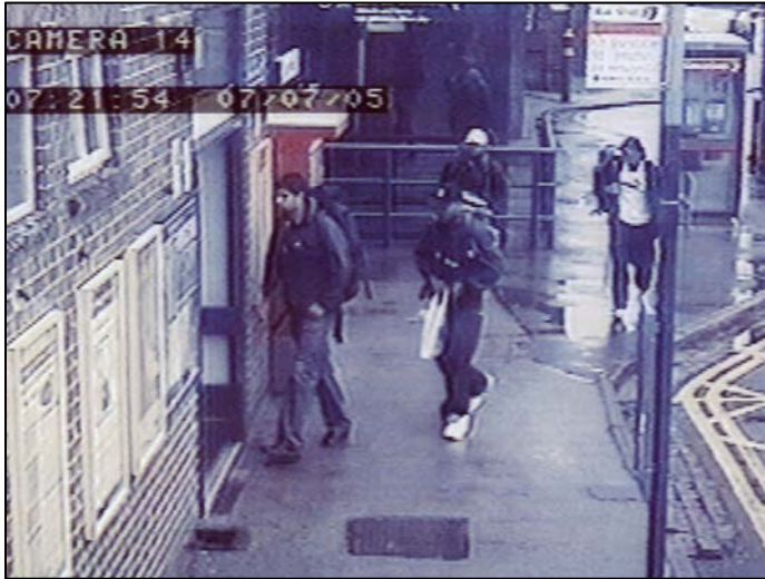
London 7/7 bombers Mohammed Siddique Khan and Shehzad Tanweer approach the station with third bomber Germaine Lindsay.

plan to build a Tablighi Jama'at mega-mosque next to Olympic Stadium, should the UK win its bid for the Olympic Games. 123 He believed the bombing was intended to disqualify Britain from winning the bid.