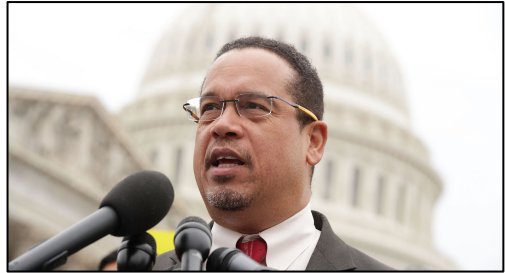
Congressman Keith Ellison in front of the U.S. Capitol