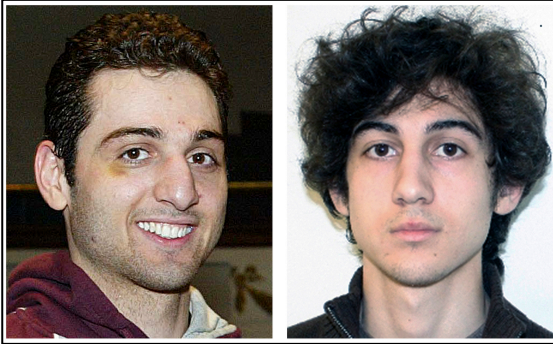
Tamerlan and Dzhokhar Tsarnaev

was more 'extreme' than theirs. In fact, they said, he was chastised for an 'extremist' outburst he made during one sermon. 158 Although the FBI was warned by the Russians multiple times after his 2012 trip to Russia, U.S. officials did not pursue the matter. Tamerlan was also implicated in the brutal murder of