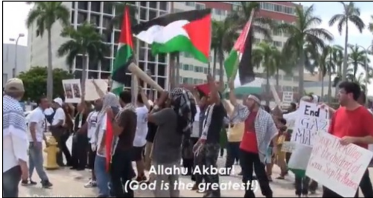
Anti-Israel demonstration at University of California where demonstrators shouted, "We are Hamas."

In recent years, there has been a "surge in the number of invited campus speakers being repeatedly interrupted or actually prevented from delivering a public lecture. A startling share of these silencing efforts has been directed at Israelis or other speakers sympathetic to Israel who have run afoul of the growing anti-Israel movement on campuses." 198