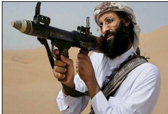
Anwar al-Awlaki in AQAP photo posing with a shoulder-mounted missile launcher (MANPAD)

In an effort to implement its ambitious plans, the Muslim Brotherhood has been methodical and highly effective. The question of whether the Memorandum was an imperative or merely a proposal has been argued since its discovery, but the point is irrelevant. Regardless of whether or not it was officially adopted as a guiding document, the suggestions it contains have been followed closely by the Brotherhood as it has built out its program in