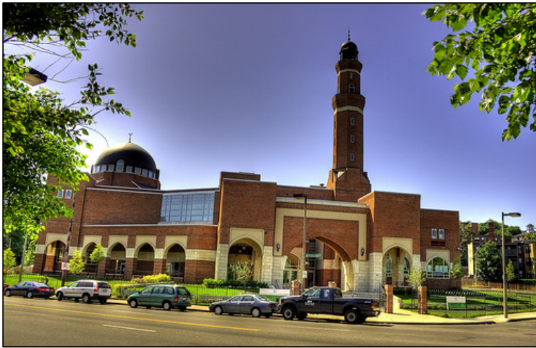
Islamic Society of Boston Cultural Center