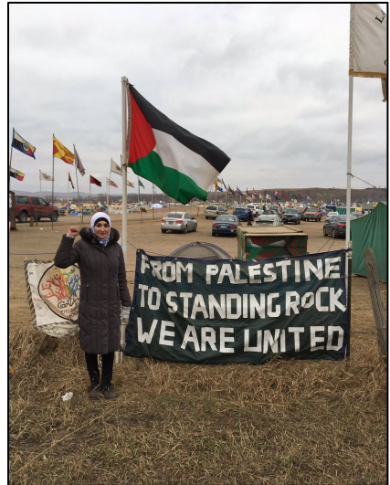
Linda Sarsour at Dakota Access Pipeline demonstration

Sarsour, who was born in Brooklyn of Palestinian parents, is a family member of Hamas operatives, who have spent time in Israeli jails for their connections to terrorist activities. 260 Nevertheless, Sarsour achieved a rapid rise to prominence and became the darling of the feminist movement as an outspoken advocate for what she calls “the rights of all women.” In a November 2016 tweet, she wrote, “We can disagree & still love each other, unless your disagreement is rooted in my oppression & denial of my humanity and right to exist.”