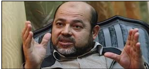
Musa Abu Marzook

Musa Abu Marzook , head of Hamas' Political Bureau, who represented Hamas in the U.S. Known for his fundraising talent, he reached out to his connections with Muslim donors in the U.S. and is credited with helping it to further its military ambitions against Israel. In 1995, Marzook was listed by the U.S. Treasury Department as a Specially Designated Terrorist. In 2002, a U.S. Federal Court indicted him for conspiring to violate U.S. laws against dealings in terrorist funds. 48