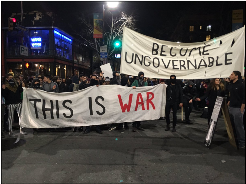
Demonstration at the University of California-Berkeley

Another tweeter, posting the next day under the name Occupy Oakland, sent her comrades to a new location to confront police, saying, “#TheVillage get down to 36th and MLK #Oakland NOW dozens of cops trying to kick out residents of tiny home village. #HomesNow #resist.”