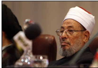
Yousef al-Qaradawi