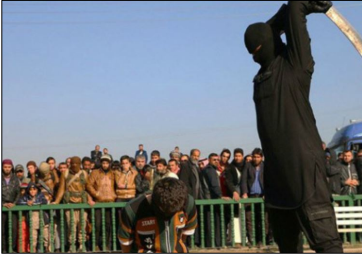
Teenager executed for missing Friday prayers

2016, a sixteen-year-old boy in the same town was arrested by IS' secret police services, also on the charge of heresy, for missing Friday prayers. He, too, was publicly beheaded. 114 On February 19 in the city of Mosul, a 15-year old boy was publicly beheaded outside the main mosque for listening to American popular music on a portable CD player in his father's store. 115