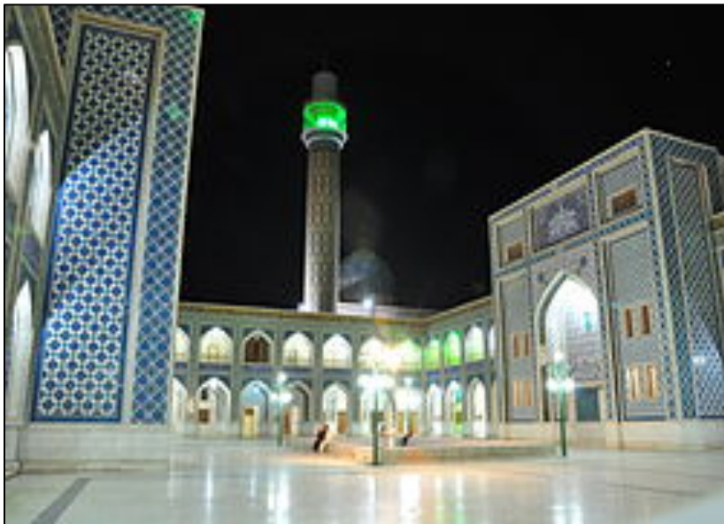
Shi'ite Uwais al-Qarni Mosque in Raqqa