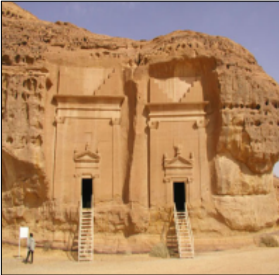
Nimrod before its destruction by IS

Among other priceless treasures destroyed by IS were ancient ruins in the city of Palmyra, another UNESCO World Heritage Site, which dates back nearly 2,000 years. As IS moved closer to the ancient city in May 2015, many