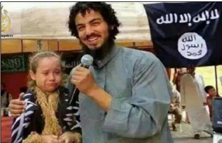
IS man and his newly acquired Yazidi sex slave

Muhammad had sexual relations with Mariyah, his Coptic slave. Mariyah and her sister, Sirin were slaves given as gifts to Muhammad. Muhammad gave Sirin to Hasan Thabit, the poet. Ibn Sa'd says that Muhammad "liked Mariyah, who was of white complexion, with curly hair and pretty." [Taken from Ibn Sa'd's "Kitab al-Tabaqat al-Kabir" (Book of the Major Classes), p151]. 86