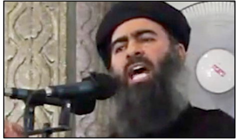
Abu Bakr al-Baghdadi

Little is known about the shadowy figure of Abu Bakr al-Baghdadi (a nom de guerre ), who is also known as Abu Du’a and the “Invisible Sheikh,” 26 but whose real name is Ibrahim Awad Ibrahim Ali Muhammad al-Badri al-Samarri. 27 U.S. State Department records list al-Baghdadi as born in Fallujah, Iraq, in 1971, although other reports put his birth in the Iraqi city of Samarra, which is more likely because of his surname which, according to Middle East custom, indicates the city of his birth. 28 Al-Baghdadi is a highly-educated scholar of Islam, who holds a Ph.D. in Islamic jurisprudence and wears the black turban to signify direct descent from Muhammad.