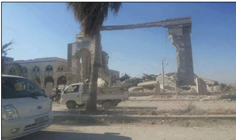
Uwais al-Qarni Mosque after IS destroyed it