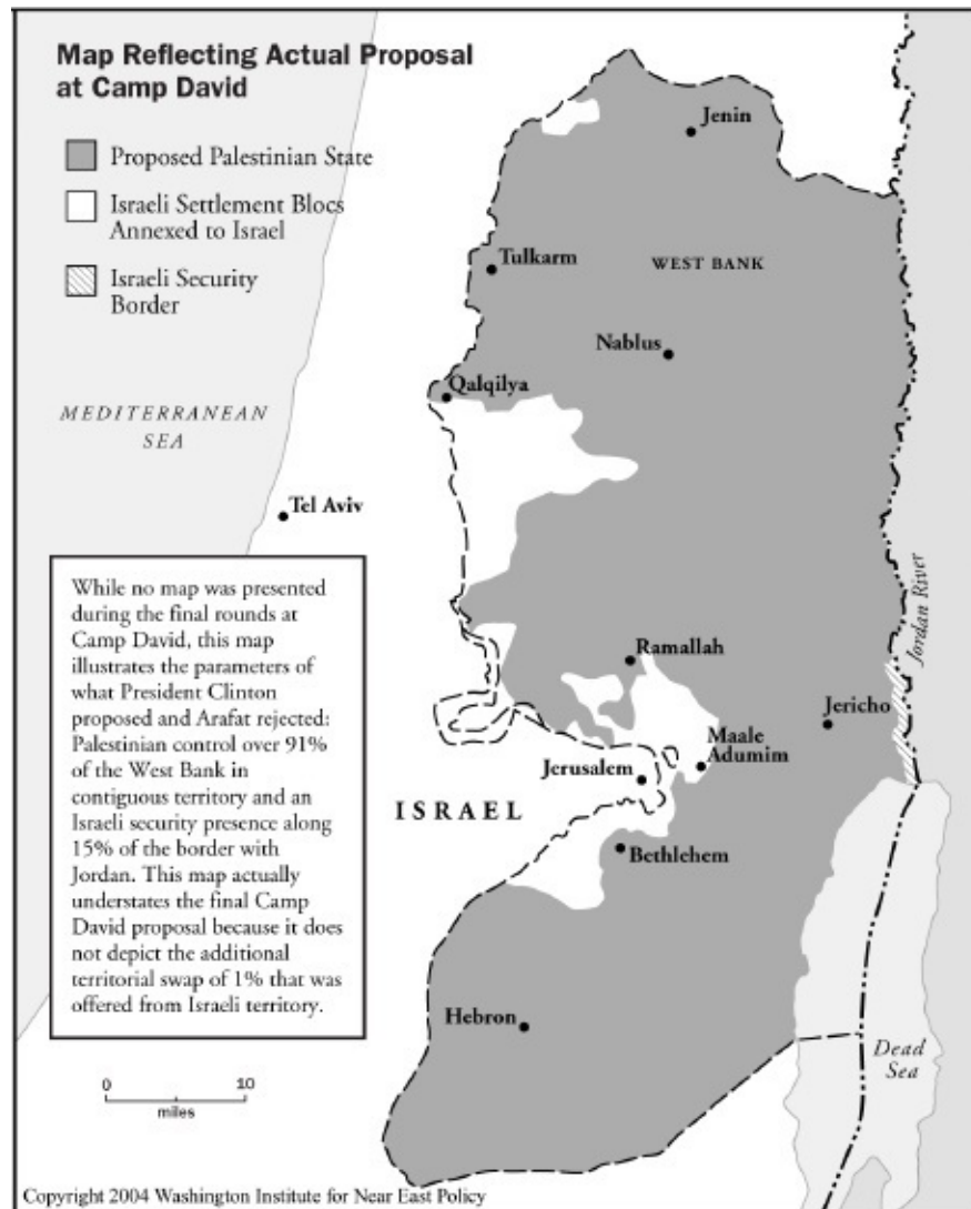
Map 3. Israel's Proposal at the Camp David Talks.

more unequivocal than that which appeared in the Clinton Parameters); they also pointed to elements that required further clarification and others that had not been addressed. These comments, however, were but an appendix to an essential “yes.” 73 The Israelis could not only live with the Clinton Parameters, they were determined to commit the new incoming US Republican administration to abide by them. 74