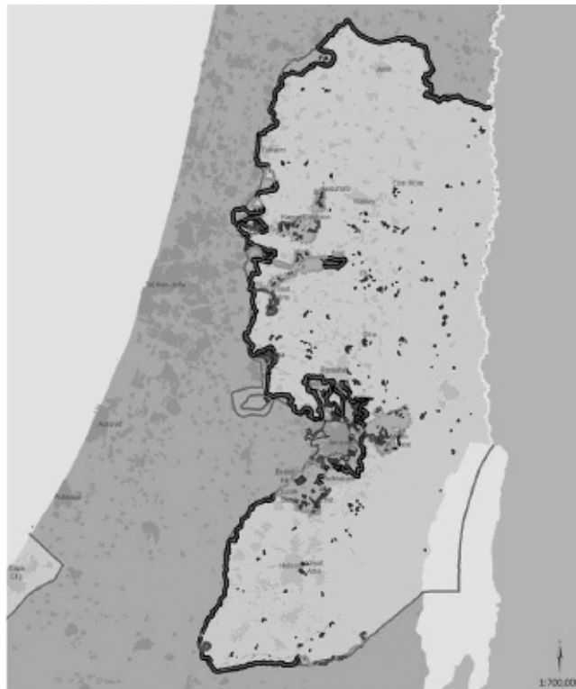
Map 6. Israel's security barrier.

Tilley, at times, overstates her case. One of many examples is her representation of the “future Palestinian state,” which, she contends, is suggested by the route of Israel’s security barrier. Israel has “an enclave plan” for the West Bank whereby the Palestinian “Bantustan,” or “walled-off Palestinian ghetto,” or “gruesome apartheid system” (the intemperate language is matched only by its incongruity with the reality on the ground) is hemmed into a tiny sliver of the West Bank highlands, completely fenced in, on the west and the east, by the Israeli barrier. 24