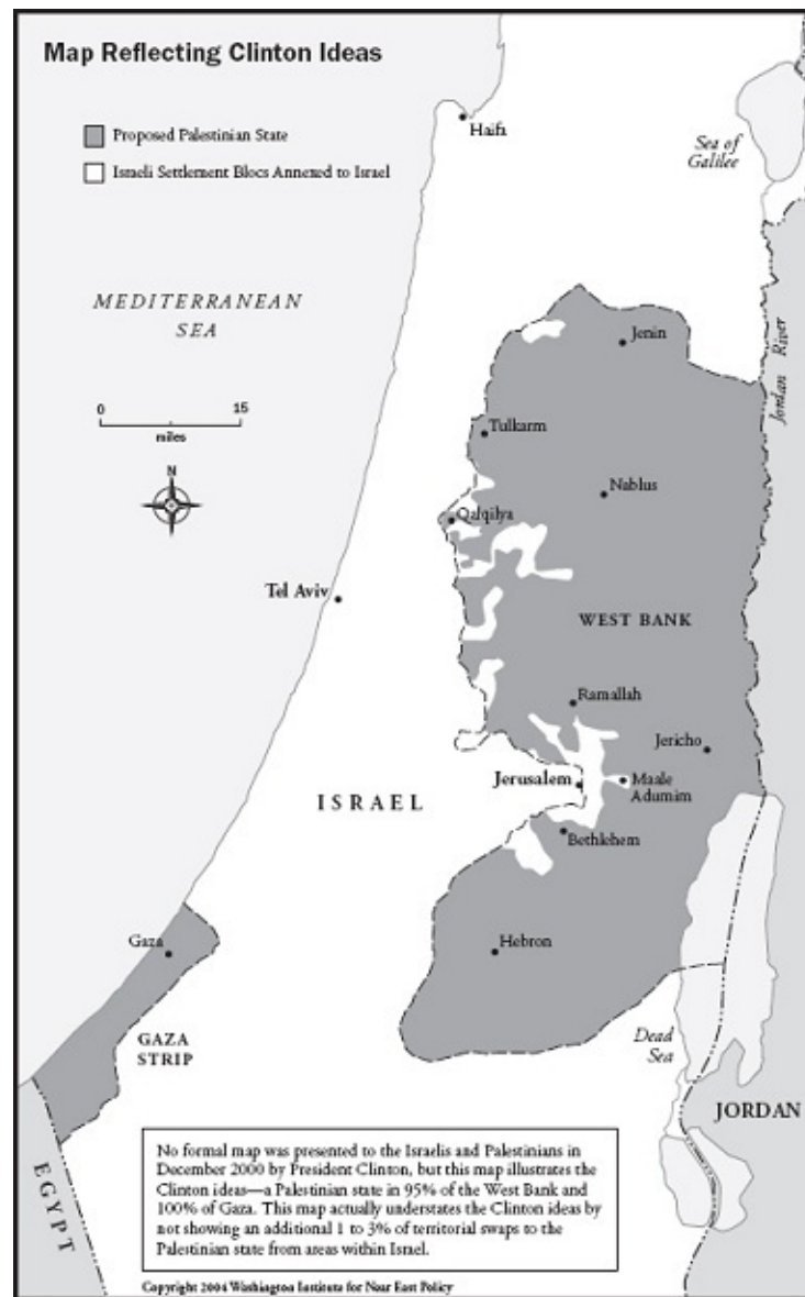
Map 4. The Clinton Parameters: the territorial dimension.

concede after the outbreak of the second Intifada. 76