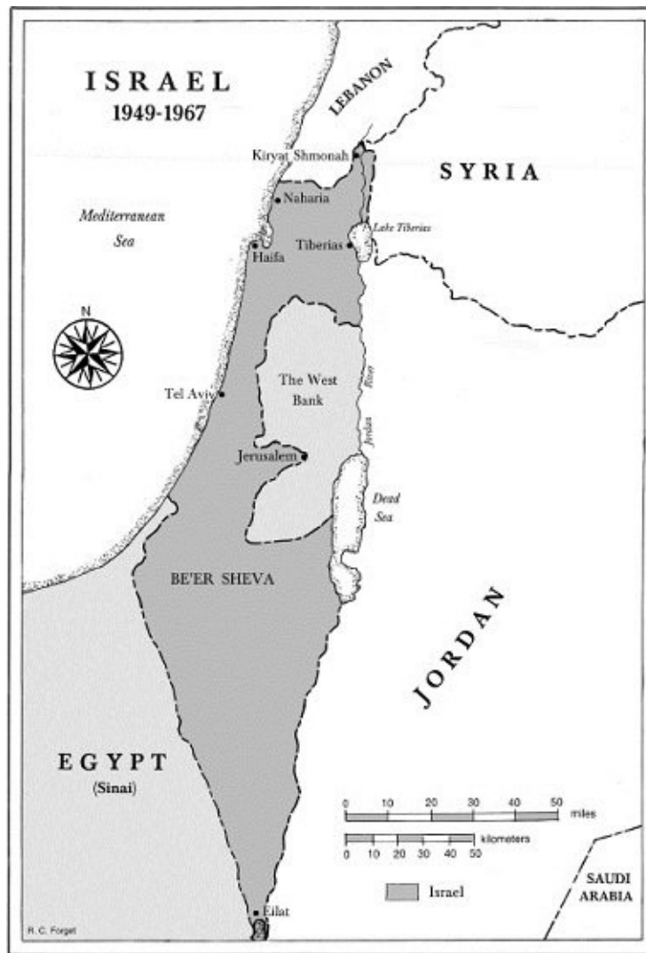
Map 2. Israel after the 1948 war

In May 1964 the Palestine Liberation Organization (PLO) was established in accordance with an Arab League resolution. The PLO's first chairman was a Palestinian political activist named Ahmad al-Shuqayri, a refugee and the descendant of a notable Palestinian family originally from Acre, in what had become Israel in 1948. The PLO in its original form was very much under the thumb of Abd al-Nasir, but after the Arab debacle in 1967, the organization was completely restructured. It was taken over by Fatah, which had launched its armed struggle against Israel in January 1965 and had already begun to overshadow the PLO prior to the war in 1967. By 1968 the PLO had been transformed into an umbrella organization of Palestinian fighting organizations spearheaded by Fatah, under the leadership of Yasir Arafat, who became the leader of both Fatah and the PLO.