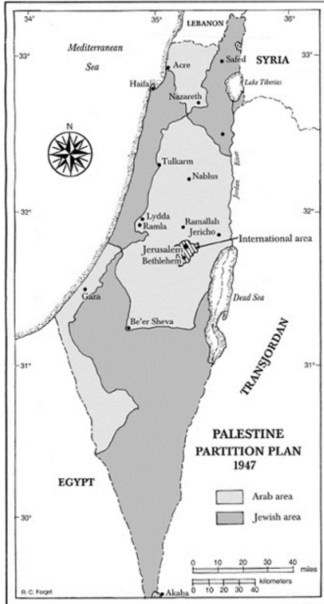
Map 1. The UN partition of Palestine, 1947

acquiesce in the subjection of “an indigenous population against its will to alien immigrants, whose claim is based upon a historical connection which ceased effectively many centuries ago. Moreover they form the majority of the population; as such they cannot submit to a policy of immigration which if pursued for long will turn them from a majority into a minority in an alien state; and they claim the democratic right of a majority to make its own decisions in matters of urgent national concern.” 28