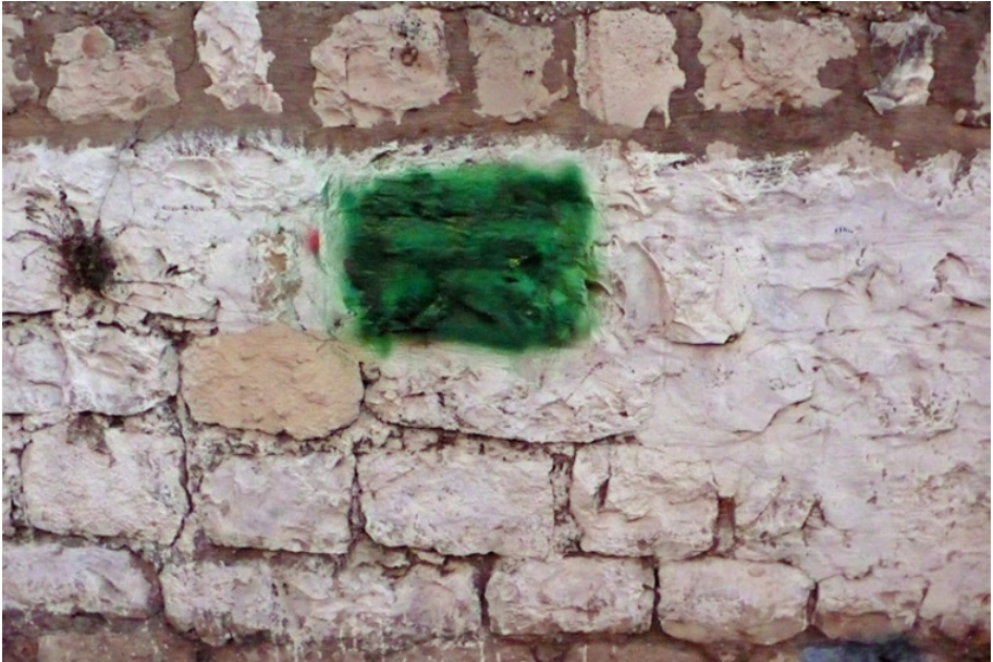
Figure 1. Taken in Haifa on October 06, 2012, the cover image is a graffiti in the predominantly Arab district of Wadi Nisnas and says “Haifa is the heart of Palestine” in Arabic. Painted in a city praised in official channels as exemplifying Israeli democracy and peaceful coexistence between Arabs and Jews, the graffiti illustrates the alienation of the Arab citizenry from Israeli society and the strong connection to their Palestinian identity. Interestingly, by the next evening, on October 07, the graffiti was already painted over. This too accounts for Arab marginalization in Israel and reveals the mechanisms of control and surveillance of Arab political and social expression in the country.